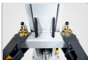
Automatic arm locks restraints.