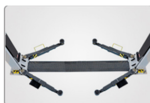
4 three-stage arms giving more flexibility to reach lifting points.