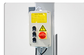
24V electric control system, safe and convenient.