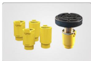
Screw pads with 75mm extensions included

Certificate No.: CE-MC-210519-027-23-5A - CCQS Ireland EN 1493:2010 Vehicle Lifts / EN ISO 12100:2010 / EN 60204-1-2018