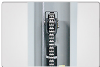
Dual Hydraulic chain driven cylinders to increase lift height.